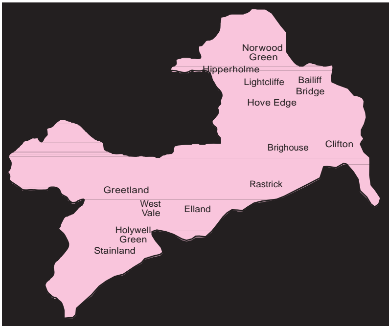
Map of Lower Valley

Produced by Calderdale Council August 2014